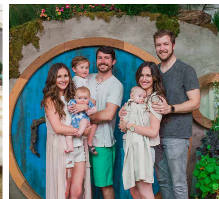
FAMILY FUN DAY, SUNDAY