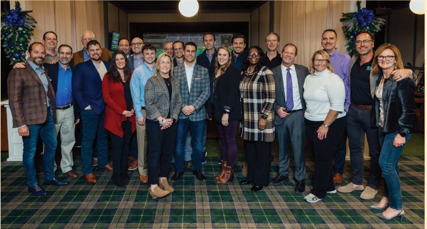
IEP physicians, Ascension Providence Rochester Hospital Emergency Department staff and hospital leaders

Ascension Providence Rochester Foundation hosted a holiday reception at The HUB Stadium in Auburn Hills, providing an opportunity for community members, philanthropic supporters, board members and hospital leaders to meet members of Independent Emergency Physicians (IEP) while enjoying a social evening together. IEP is the new physician group providing care to patients in the Emergency Department at Ascension Providence Rochester Hospital.