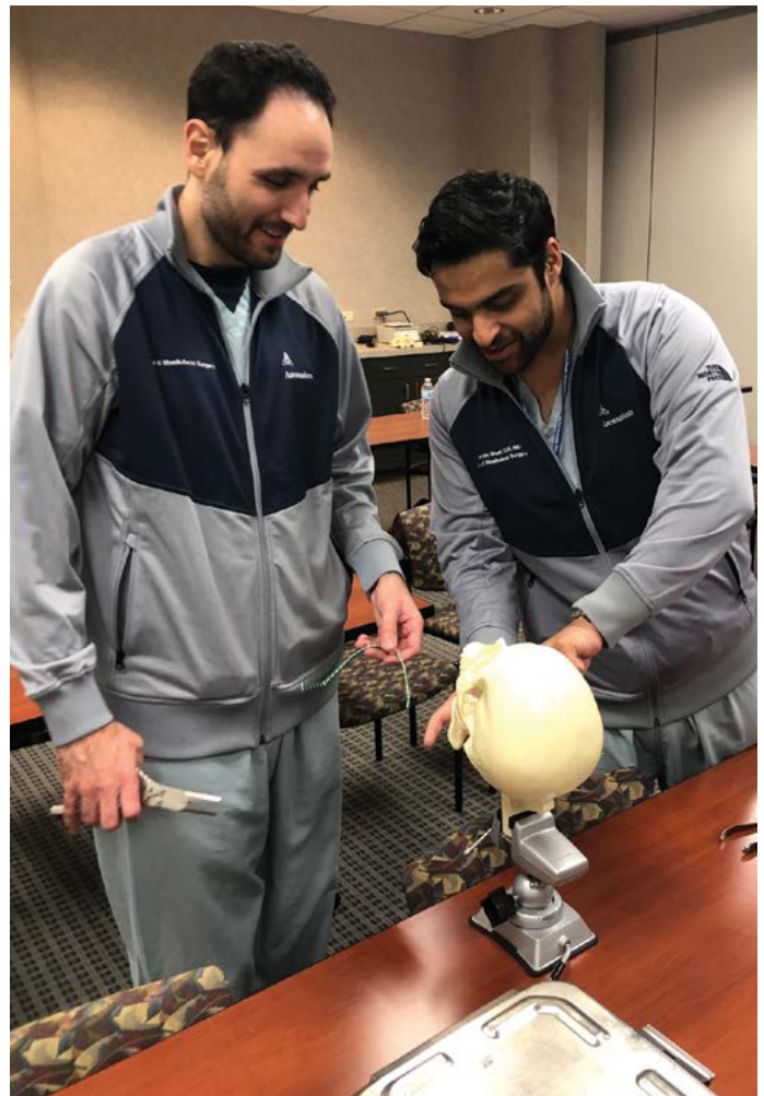
Oral & Maxillofacial Surgery residents get hands-on training.

The resident clinic is located in downtown Detroit, where it has served thousands of patients, including the underserved and vulnerable, for more than 50 years. The Oral & Maxillofacial Surgery program takes pride in continuing its commitment to patients in the community.