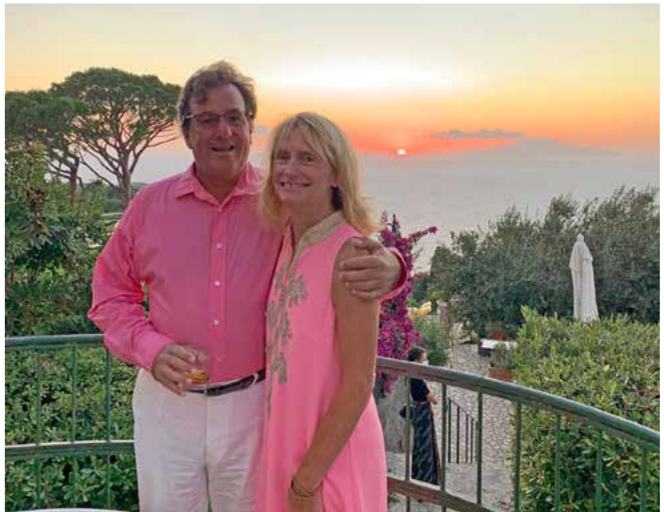
The Basiles enjoy a sunset while vacationing in Europe.

The Basile's generosity was never more evident than during the early stages of the COVID-19 pandemic.