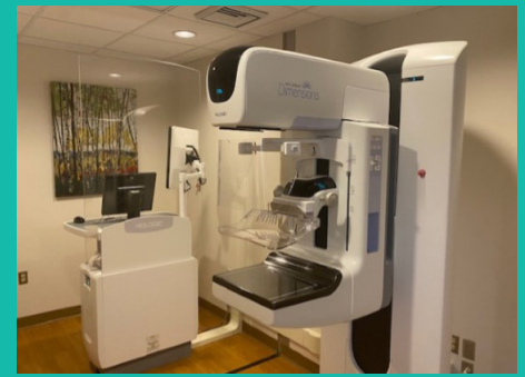
New 3D Mammography machine in Ascension Mercy Hospital Breast Center