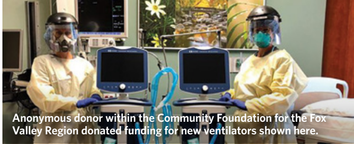
Anonymous donor within the Community Foundation for the Fox Valley Region donated funding for new ventilators shown here.